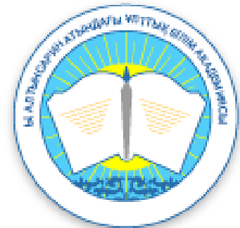
National Academy of Education of the Republic of Kazakhstan named after I. Altynsarin