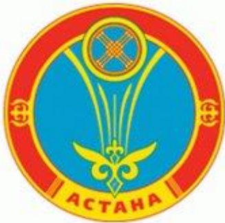
Astana the Republic of Kazakhstan